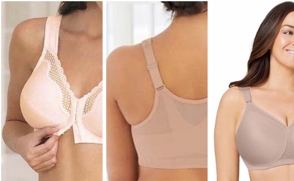
FRONT OPENING/CLOSING BRAS

RECEIVE $20 OFF YOUR FIRST PURCHASE. SIMPLY USE THE CODE PHYSIO20 (T&CS APPLY*).